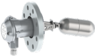
A 41C80 404 DIN flange PN16 DN100, Hastelloy C Standard execution for operating temperatures up to 330°C.