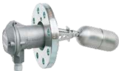
B 31CE43 04H1E243 DIN flange PN16 DN80, Hastelloy C SIL1, SIL3 capable Standard execution for temperatures up to 150°C